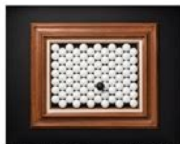
"There Is a Herd" by Dale Phelps is licensed under CC BY-NC-ND 2.0.

[1] Conformity or acting the way most other people in one's social group act, often grows out of a person's desire for security and belonging in a group—usually a group of similar ages, culture, religion, or educational background. Acting differently from the group carries the risk of social rejection, a deep fear that many people have. The drive to conform is often particularly powerful for adolescents, for whom acceptance by peers can be a primary goal, but it also affects people of all ages. Some studies suggest that conformity decreases with age. (1)